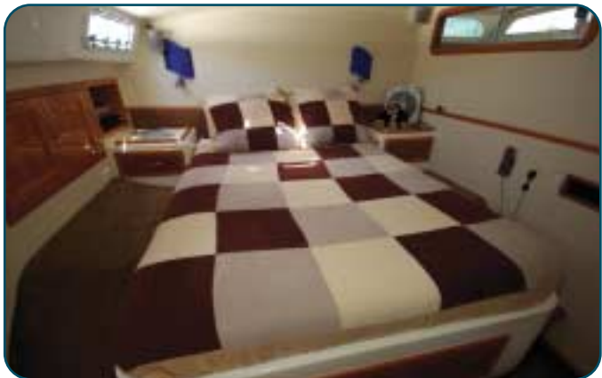
Zambezi is an impressive example of the popular Perry 57 Passagemaker catamaran.

The Perry 57 has the hallmarks of a great cruising yacht: supreme comfort, luxurious appointments, classic timber work, expansive entertainment areas, and a performance under sail that will excite the most discerning cruising yachtsman. Its twin 230 Hp diesels provide an enviable cruising speed of 10 knots.